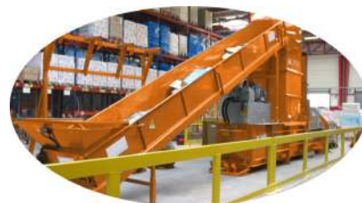
OPTION: CONVEYOR BELT

We reserve the right to make changes to specifications without prior notice. Bale weights are dependent upon material type.