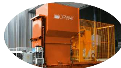
OPTION: BIN LIFTER

We reserve the right to make changes to specifications without prior notice. Bale weights are dependent upon material type.