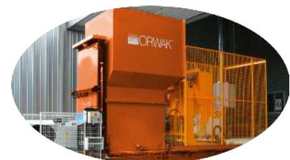
OPTION: BIN LIFTER

We reserve the right to make changes to specifications without prior notice. Bale weights are dependent upon material type.