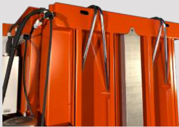
Pipes for easy bale strapping

This model comes with a cross cylinder and offers an extra compact machine design with a transport and installation height of only 2000 mm. The low height simplifies transportation to the installation site and provides broad location opportunities.