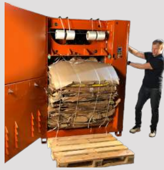
Simply push two buttons for bale ejection!