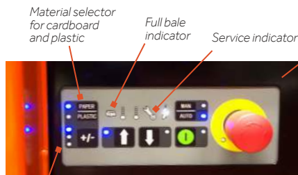
Adjustable bale size

The bales weigh up to 250 kg and are easily removed thanks to a semi-automatic bale ejection function.